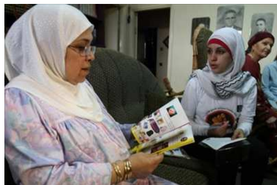
A Palestinian woman leafs through a booklet handed out by Palestinian youths during a house-to-house campaign to combat Israeli settlement products in the West Bank city of Ramallah on May 18 2010.